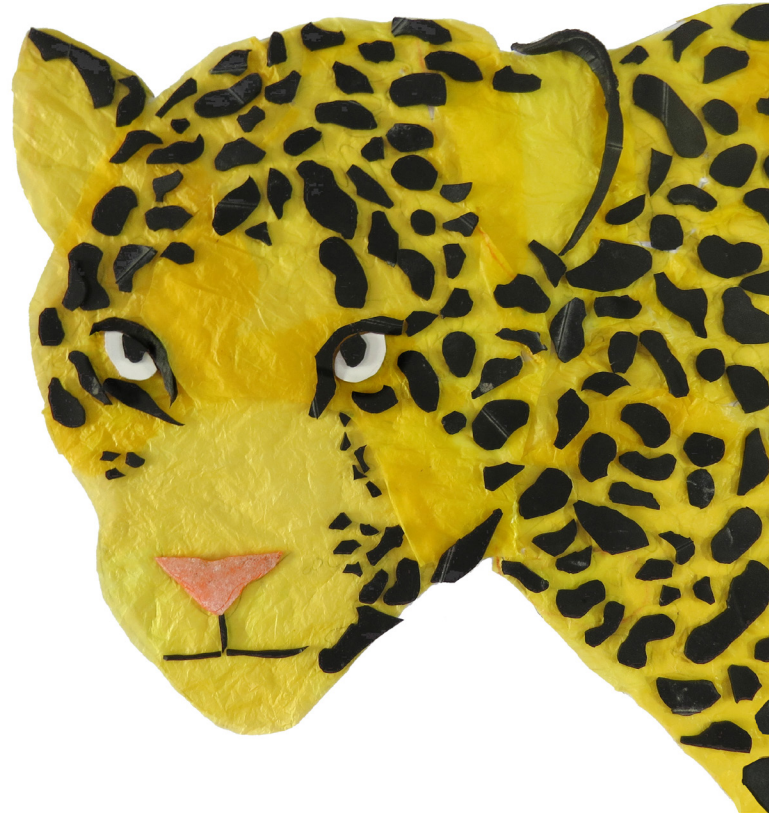
Illustration: "THE JAGUAR" made by the students of the La Aljaba Foundation (Leticia) within the exhibition "Plastic and our jungle"

I n order to achieve its objectives in conservation, Entropika also contributes indirectly, to a greater or lesser extent, to UNDSGs # 1 "no poverty", 4 "quality education", 5 "gender equality", 6 "clean water and sanitation", 10 "reduced inequalities" and 16 "peace, justice and strong institutions".