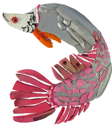
Illustration: "THE PIRARUCU" made by the students of the La Aljaba Foundation (Leticia) within the exhibition "Plastic and our jungle"

We have also noticed that the participation of women in decision-making processes (ex. election of legal leaders has increased); women now intervene more often during community assemblies and meetings, or during the execution of