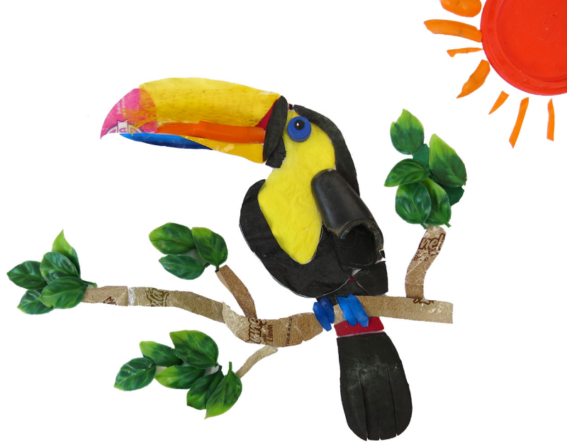
Illustration: "THE TUCÁN" made by the students of the La Aljaba Foundation (Leticia) within the exhibition "Plastic and our jungle"

is exposed to, as to prevent or minimize negative impact on long-term operations.