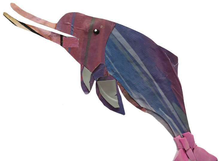
Illustration: “THE PINK DOLPHIN” made by the students of the La Aljaba Foundation (Leticia) within the exhibition “Plastic and our jungle”