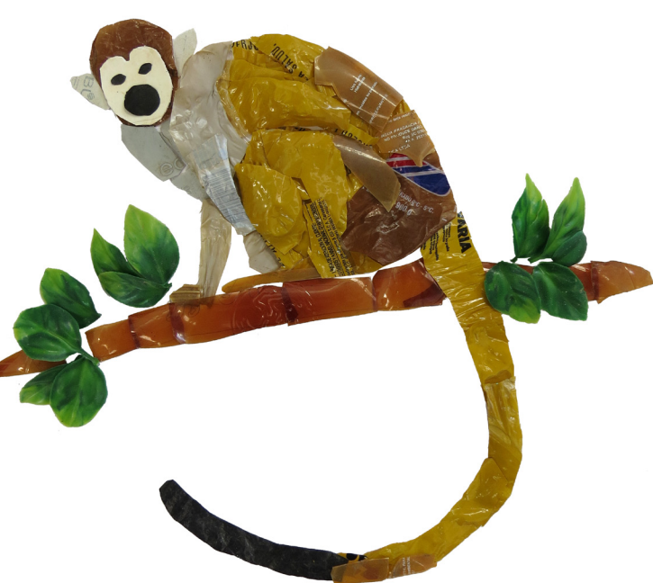
Illustration: "THE FRAILE" made by the students of the La Aljaba Foundation (Leticia) within the exhibition "Plastic and our jungle"

– National Learning Service). This was a necessary capacity-building step as the water team often has to work on the concrete water towers built by Entropika.