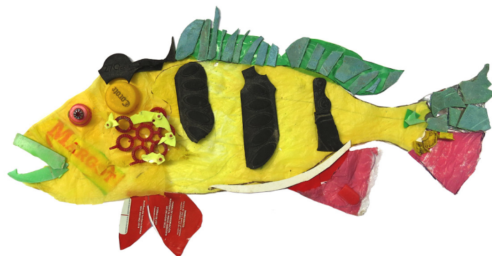
Illustration: "THE TUCUNARE" made by the students of the La Aljaba Foundation (Leticia) within the exhibition "Plastic and our jungle"